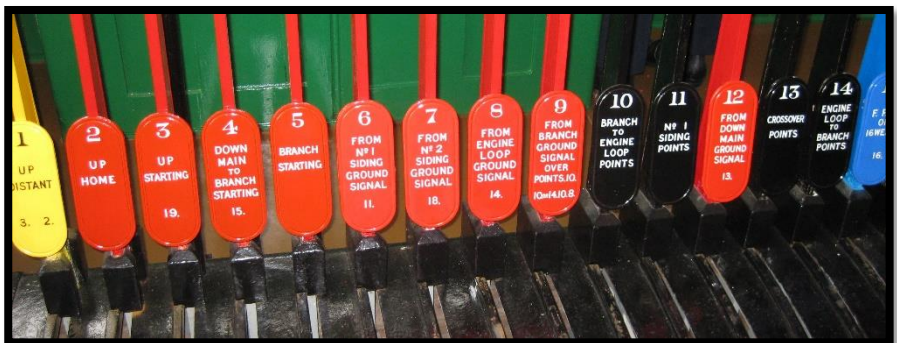
Point and signal levers in the restored signal box