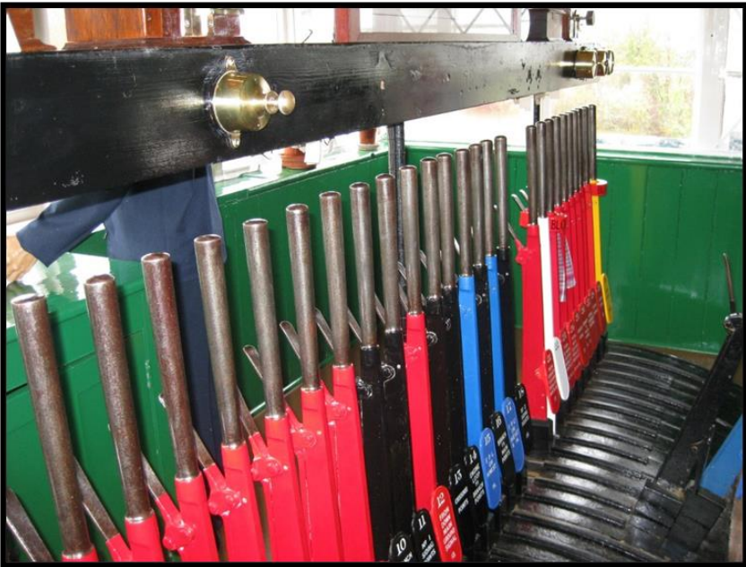
Interior of the restored box showing the point and signal levers.

Our signaller was kept busy exchanging tokens, but he also had to switch the points on the line so the trains would go on the right track, for example a train coming off the branch and on to the main line, or a train from Ryde being switched to the correct platform and line to Sandown. The switching is done by pulling the levers in the box.