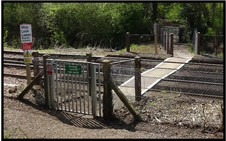
Pig Leg Crossing