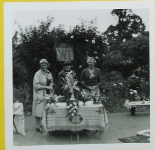
OUR STALL AT THE W.I TENT AGRICULTURAL SHOW 1960