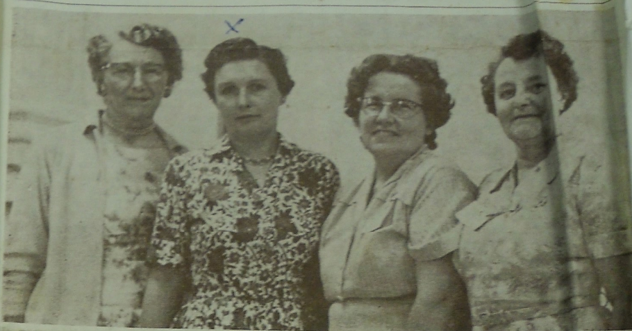
NEW DISTRICT PRESIDENTS ON PROVINCIAL BOARD