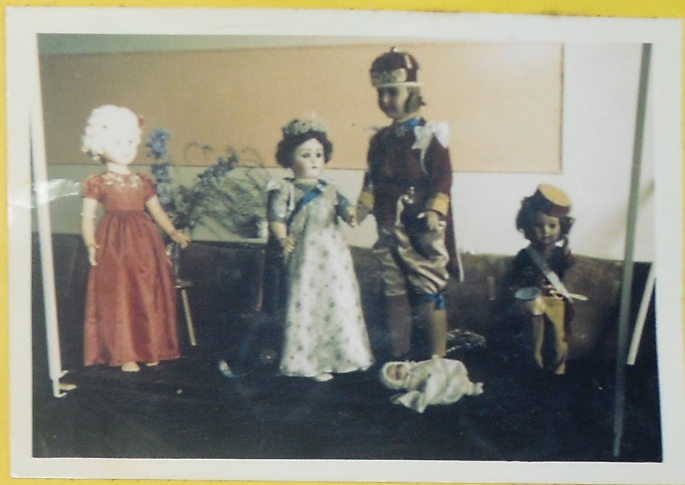
AGRICULTURAL SHOW "NURSERY RHYME DISPLAY" 1964