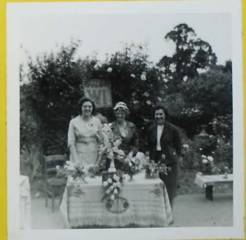
AT. PRIORS COTTAGE GARDEN MEETING. JUNE 1964