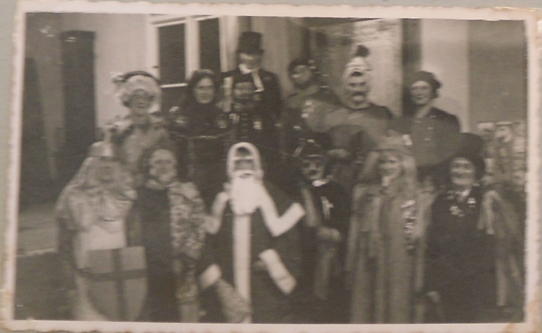
"THE CHRISTMAS BOYS" OLD FRIENDS PARTY 1952