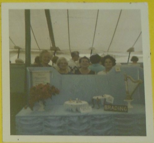
SHOW DISPLAY 1969 depicting a poem