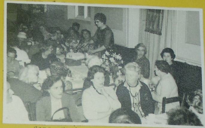
PRESIDENT CUTTING THE CAKE