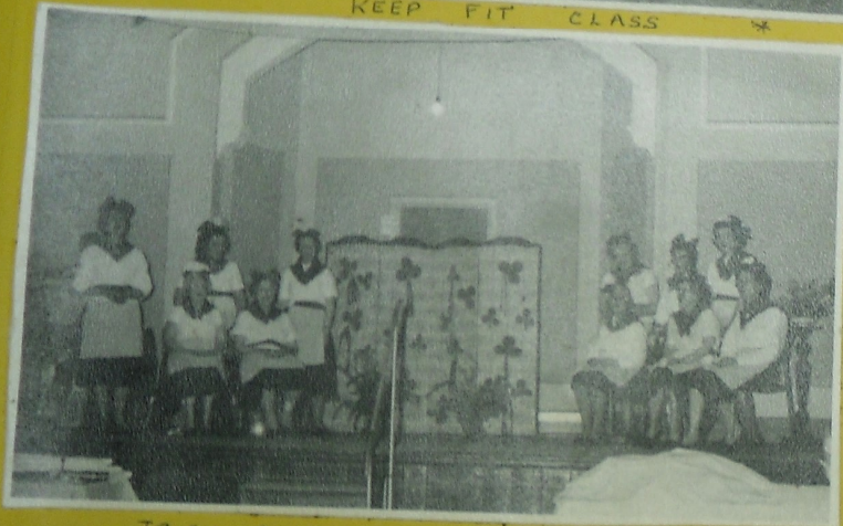
IRISH SONGS BY W.I. CHOIR