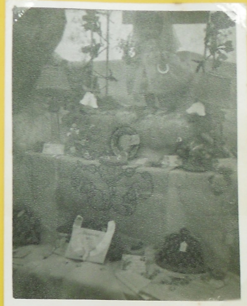
"SHOWER FOR THE BRIDE"