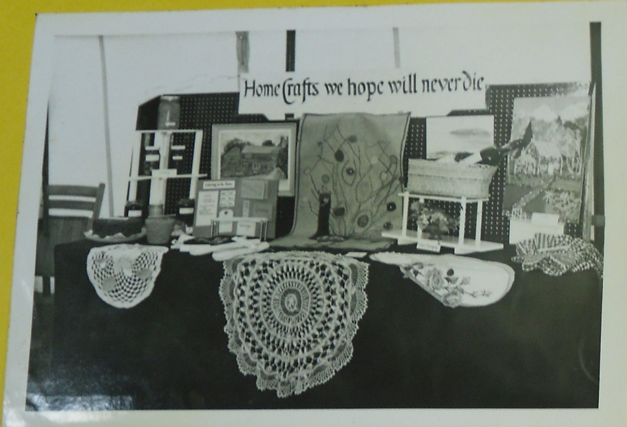
DISPAY AT AGRICULTURAL SHOW 1968