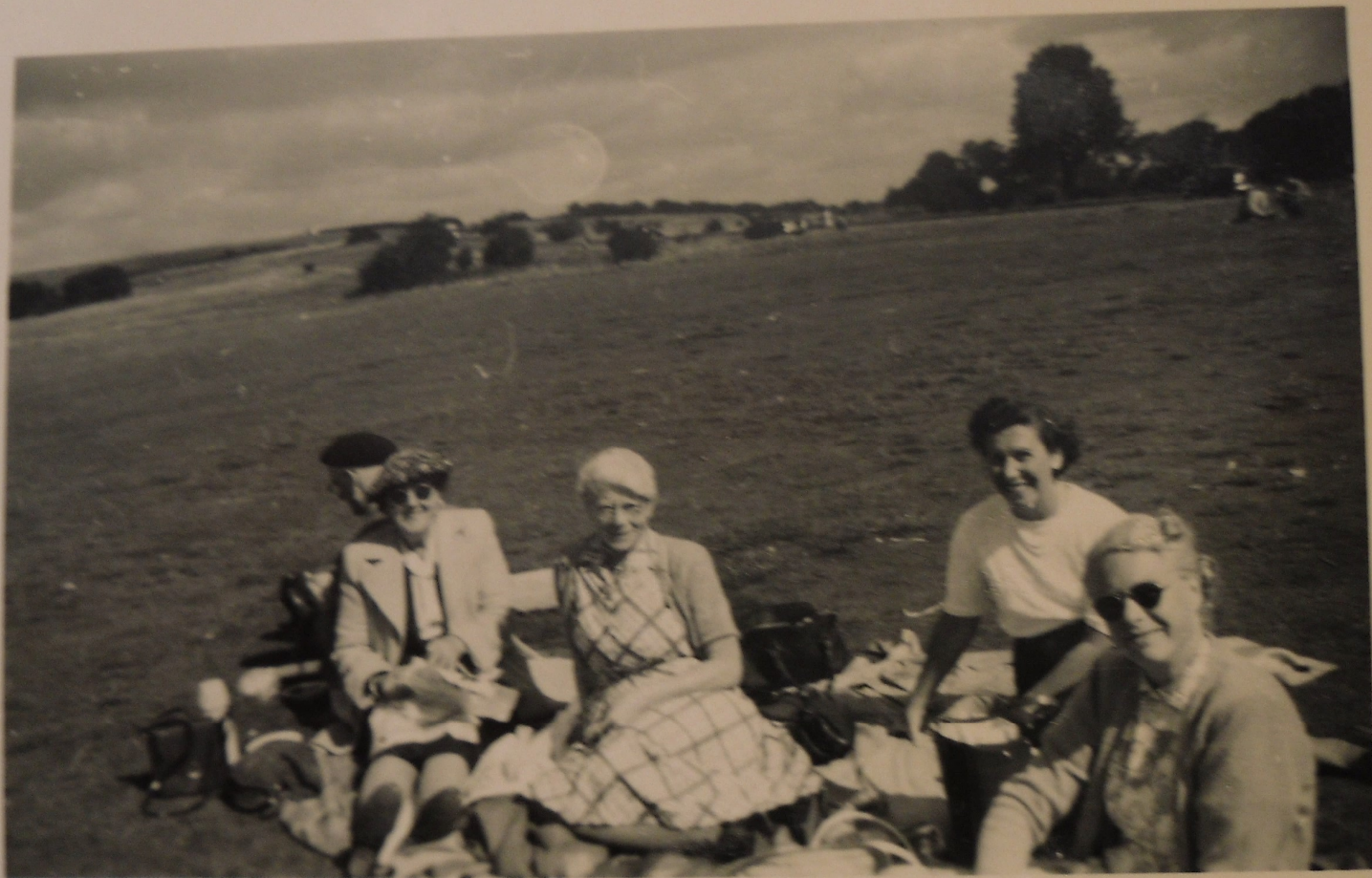
Some members on the outing to Wisley May 1954.