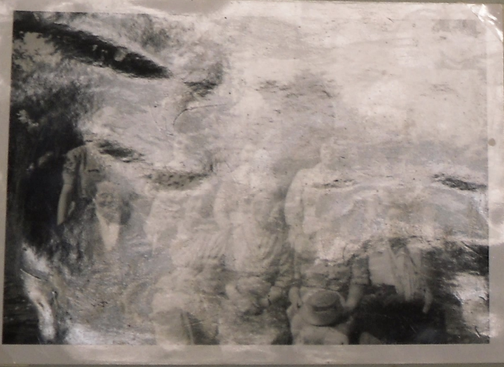
The Committee at Garden meeting, Priory Cottage June 1959