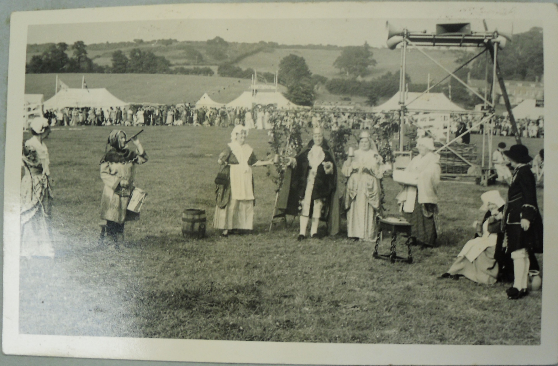
Brading's Tableau at the I.W. Agricultural Show July 1956. Depicting the Whitsun Ales ceremony.