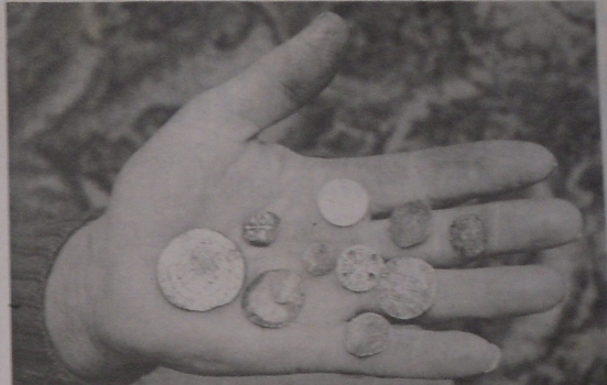
Some of the ancient coins found at Brading.