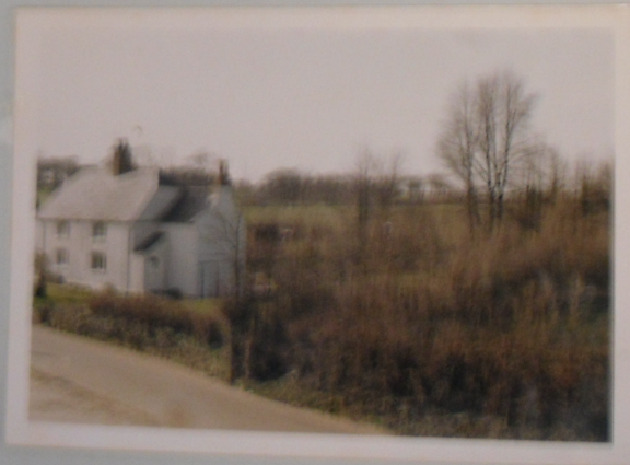
Old houses opposite in Coach Lane