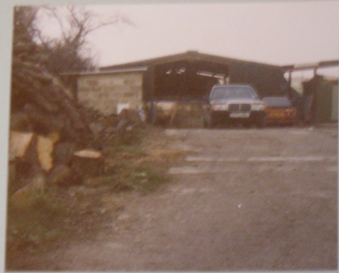
Garage + small holding. S. side