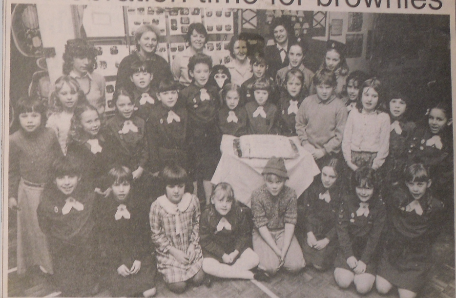
PAST AND present Brading Brownies joined together for the tenth birthday celebrations of the pack recently.

The celebrations, held at Brading Primary School, were attended by over 85 adults and children, including some of their original members.