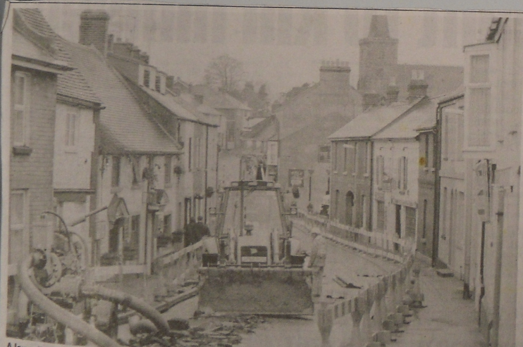
A lone digger slowly breaks up a section of Brading High Street to make way for a new sewer in an operation due to end by February 12.