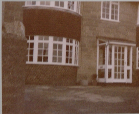
Mulberry Lodge (new house) '09 N. side