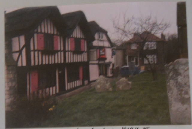
WAX MUSEUM - also fronting HIGH ST. originally two (16th C. MagasR) now incorporating sundry later properties