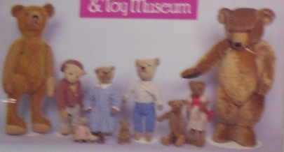
The Lilliput Antique Doll & Toy Museum