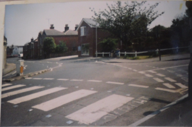
In 1971 a Wooden Seat and a flowering Tree was planted in the space of grass thus provided for. They marked the half centenary of the foundation of Brading W.I. BELISHA CROSSING CIRCA 1979