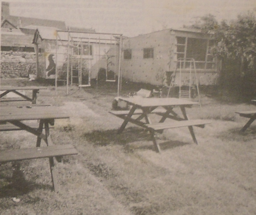
The garden of the Bugle Inn, showing the specially designed children's play area