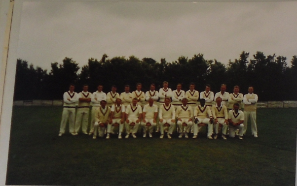
Sunday 5th July 1992 Brading Cricket Club v The Nat West Bank Old England XI at Middlemead 12 noon-6.45p.m.