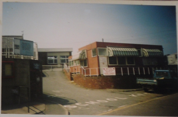
A Doctor's Surgery was built on Land Acquired opposite this, Land which was once a large Garden with Spring and Pump in it. This building had only a ten year life span, and in due course, the Doctor moved out and British Red Cross moved in, Brading Group and a detachment from Sandown. CIRCA 1976 Meetings, First Aid Classes and Play School are held there, also small Sales and such like.