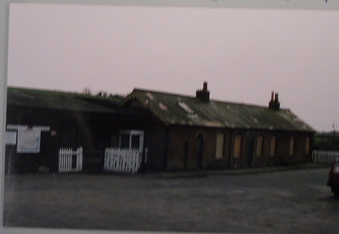
BRADING STATION BEFORE BEING RENOVATED 1988