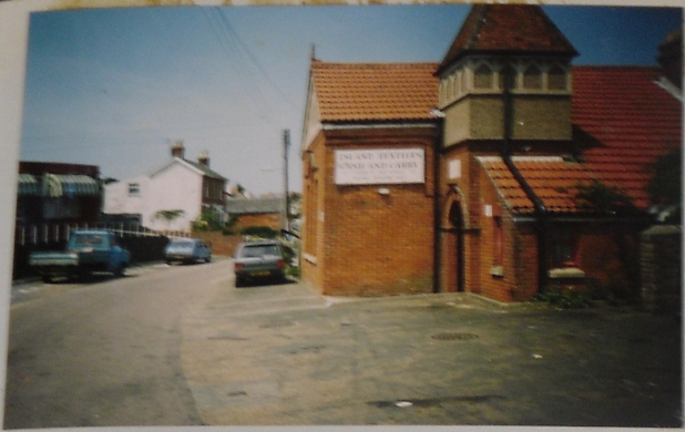
In the West Street area, the Church Hall went up for sale about 1970, few folk wanted to use it and it cost the Church of St. Mary's more to run than it was worth. A Car Park of small dimensions was built adjacent.