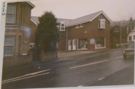
The old Shop adjacent which had been a Butchers, a Chemist and lastly a Fruit Cabin and Fish & Chip shop, was not demolished till around 1985. In 1988-89, a Glass Goods Showroom and Store with dwelling above was built in its place - called Arnold House.