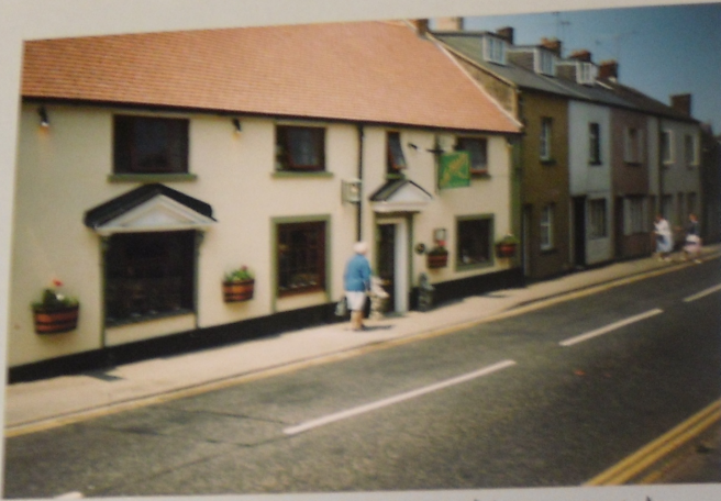
1989 Mr. New outside restaurant 'A. la. Carte' once Red Lion - then private house - then pizzeria, a bistro, etc. Badger Bistro Red Lion. Closed in 2005 'The Snooty Fox' 2006 - 'The Sly Fox'.