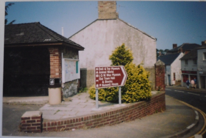
AN UGLY SIGN POST. 1989.