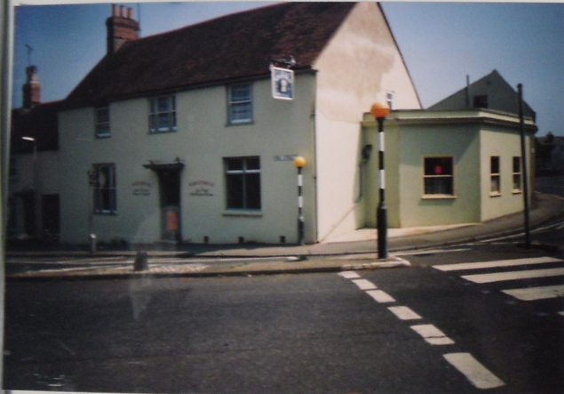
WHEATSHEAF - FRONT.