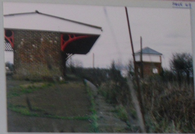
BRADING STATION 1989