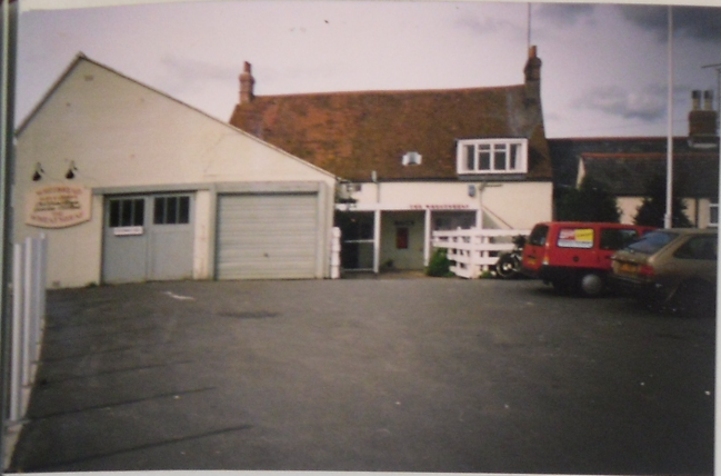
THE WHEATSHEAF INN 1989 (BACK VIEW)