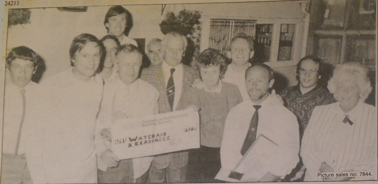
Picture sales no. 7844.