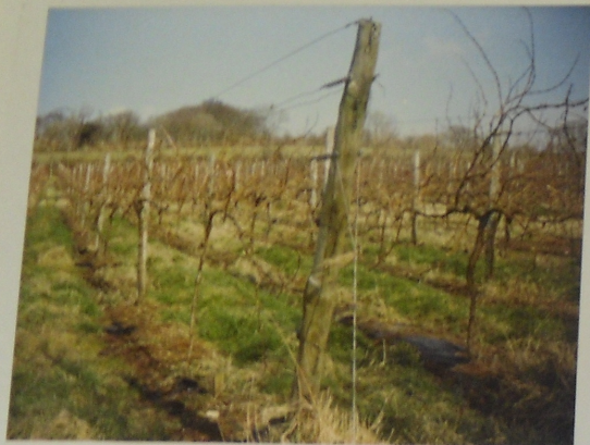
PRUNING - before (left) after (right)