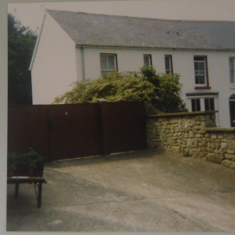
LINDEN TERRACE, The Mall before and after renovation.