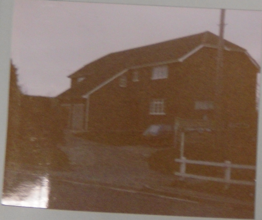
New house Broadstone Crescent where Payne's cafe used to be. W. side