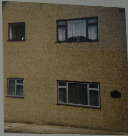
Two Flats built on site of TROTT'S Shop, The Mall.