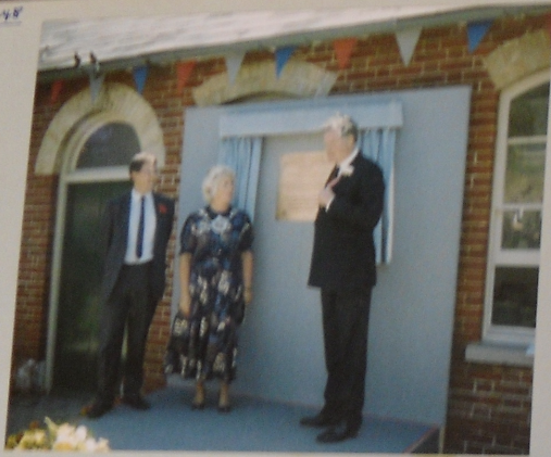
THE OPENING OF BRADING STATION HERITAGE CENTRE 1990