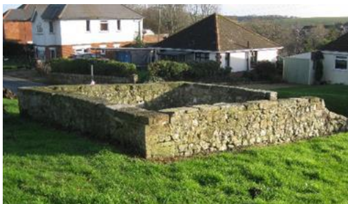
The town pound in Quay Lane where the Hayward would secure stray animals to be released on payment of a fee

Pound Breach or rescue: that people have broken into the Town Pound and taken their animals out without paying the fine to the Bayliffs or Haywarden.