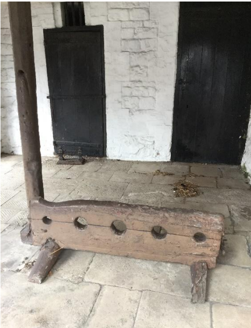
The stocks and jail or lock-up in the Old Town Hall

we present: means 'we instruct the Bailiffs' or 'we state that'.