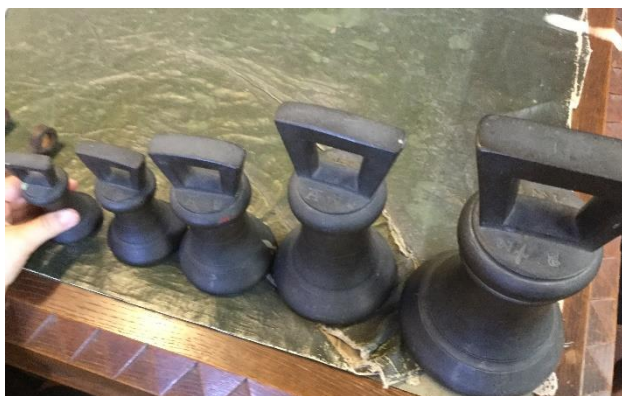
Weights used to check traders were weighing goods correctly